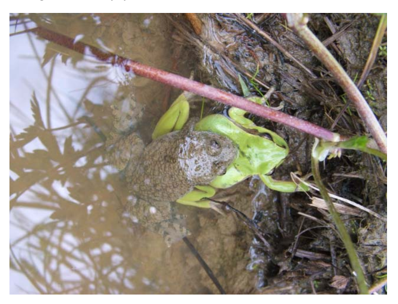
Figure no.4 A male Bombina variegata clasping a female Hyla arborea. No interspecific spawning was observed (Photo T. Hartel, Breite, Sighișoara).

suggest this is a strategy to increase the probability to finding a mate: being resident in a period when most of females are searching for new ponds (in rainy years) could be more advantageous than being migrating. However a large percentage of males were found to be migrating in rainy years as well (Hartel, unpublished data).