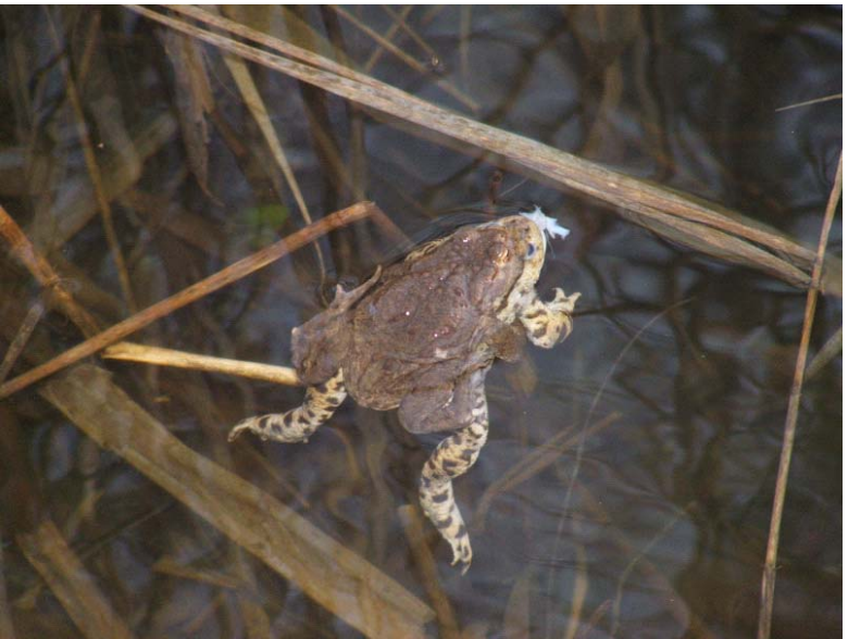
Figure no.3 Several males clasping a female (above) may result in injuries that lead to death of the female (below). This occurs frequently in Bufo bufo (Photo T. Hartel, Şercheş pond, Sighişoara)