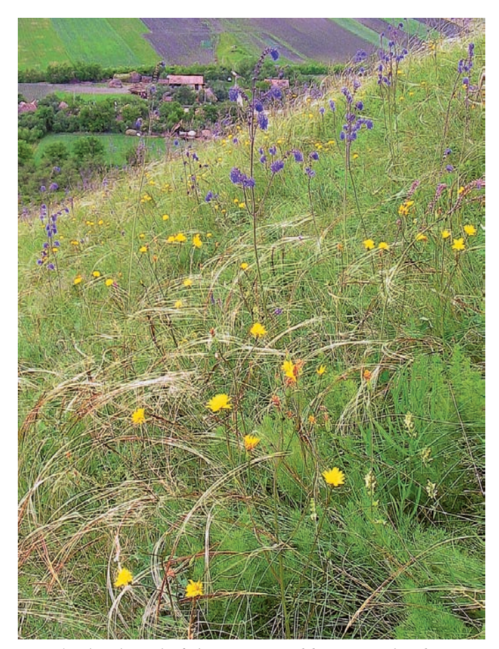
Fig. 4: Long-term abandoned stand of the Stipetum pulcherrimae with Salvia nutans , Leontodon crispus , and Adonis vernalis near Suatu (Photo: Mónika Deák, May 2003).

Abb. 4: Vor langem brach gefallener Bestand des Stipetum pulcherrimae mit Salvia nutans, Leontodon crispus und Adonis vernalis bei Suatu (Foto: Mónika Deák, Mai 2003).