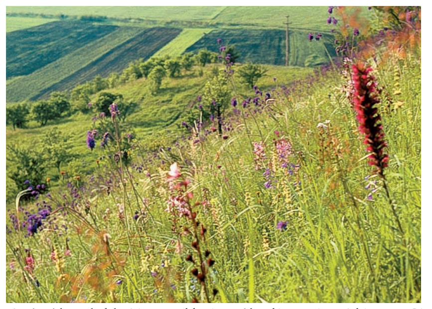
Fig. 3: Species-rich stand of the Stipetum pulcherrimae with Echium russicum, Salvia nutans, Dictam nus albus, Stachys recta, Verbascum phoeniceum , and Campanula sibirica near Mociu (Photo: Eszter Ruprecht, May 2001).

Abb. 2: Extensiv beweideter Bestand des Stipetum lessingianae mit Nepeta ucranica nahe Valea Florilor (Foto: András Kun, Mai 2003).