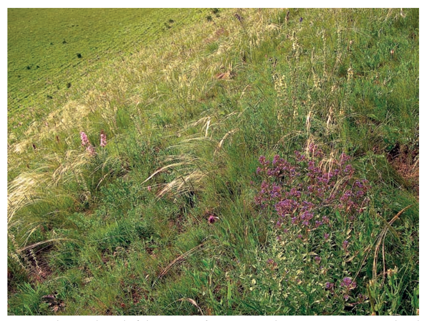
Fig. 2: Extensively grazed stand of the Stipetum lessingianae with Nepeta ucranica near Valea Florilor (Photo: András Kun, May 2003).

Abb. 2: Extensiv beweideter Bestand des Stipetum lessingianae mit Nepeta ucranica nahe Valea Florilor (Foto: András Kun, Mai 2003).